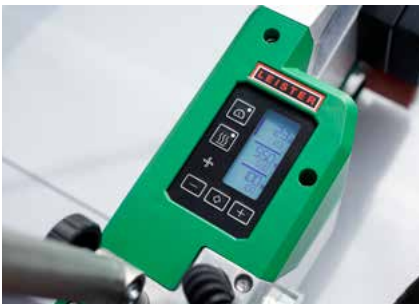
Regulated welding parameters

The compact UNIROOF 300 automatic welding machine is ideally suited for welding medium to large, flat roofs and is ideal as an entry-level machine due to its simple operation.