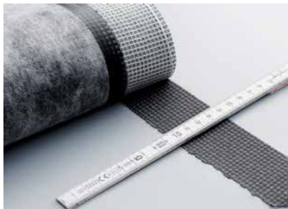
Standard nozzle for optimum weld seam width