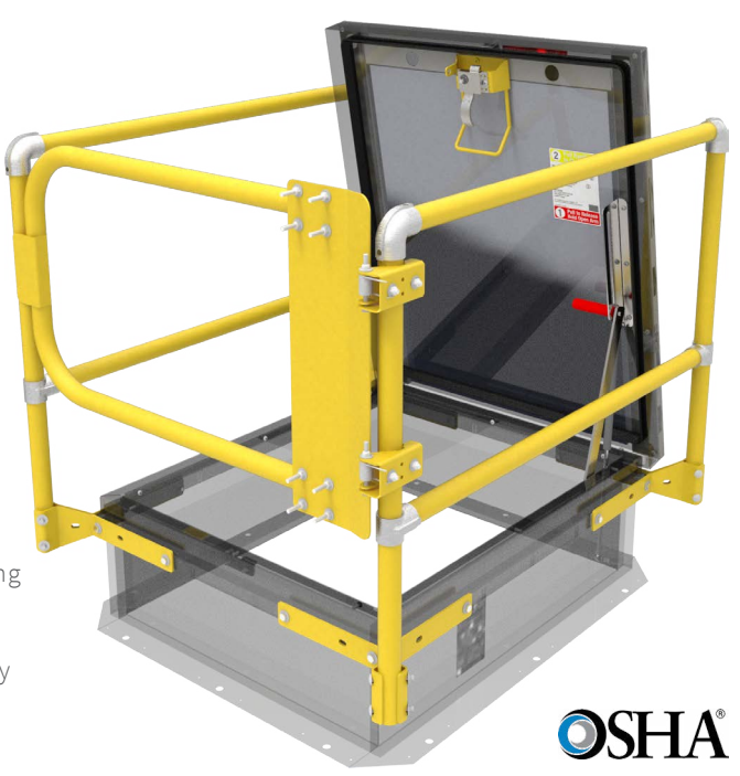
Safety Yellow Powder Coat option shown

OPTIONAL SELF CLOSING GATE (shown) Designed to automatically close, the gate is constructed with spring loaded hinges to protect against falls.